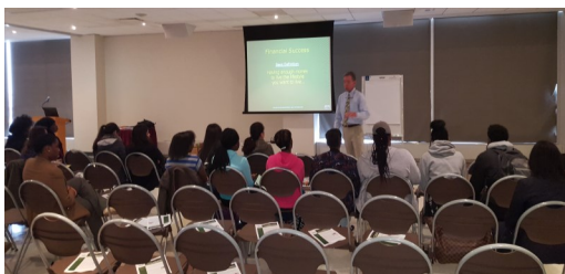
Financial Literacy Workshop

In closing, they answered a lot of questions that I had about college and new experiences/trials that I may face while I'm moving on to do better with myself and my education. I thank the TRIO Talent Search Program for giving me the opportunity to better myself and help me figure out what I want for my future and how to go about getting it.