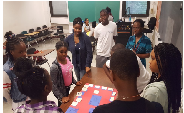
Creating board games with the Counselors