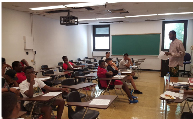
Male Group Workshop