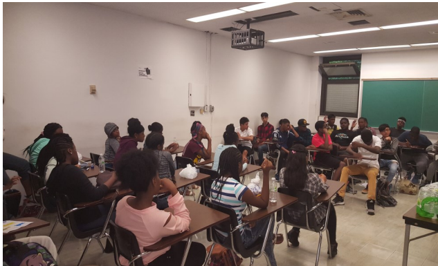
Lunch Debate Workshop

For this year's Summer Program, the Educational Talent Search Program collaborated with the STEP Program. Students enrolled in both programs took part in a variety of courses such as Microbiology, Personal Finance, and SAT Prep. In the afternoons, the TRIO Counselors facilitated workshops that centered around academic advisement, healthy eating and creating board games. The Summer Program was a great way to cap off the end of a productive school year, while looking forward to a new one.