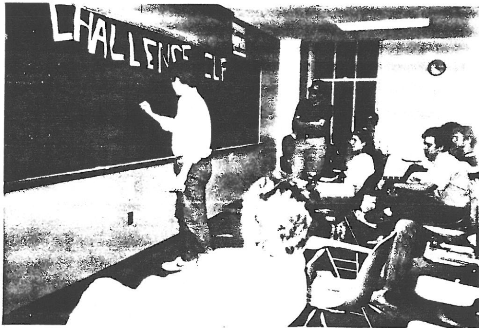
The Heart of the Action: Students at the board, faculty challenger waiting, and part of the audience