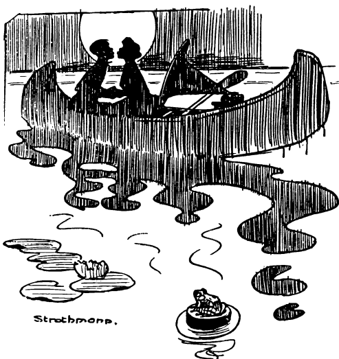
"With a gramophone caroling love songs from amidsthips."

I was among those present, and became particularly keen on the efforts of opposing interests to impress upon the committee by specious argument and fallacious interpretation that the composer of music had no rights under the Constitution that they were bound to respect; and that remedial legislation was wholly out of the question until the Constitution had first been amended.