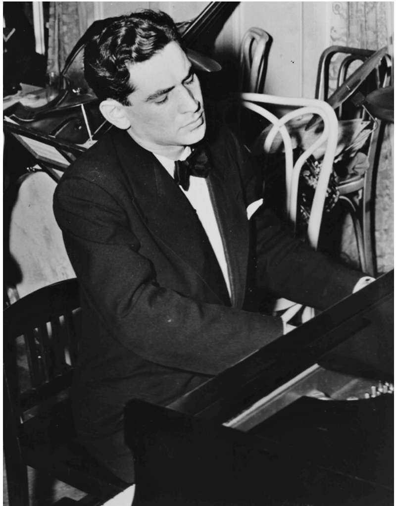
Leonard Bernstein at the piano

Bernstein's piano music is often recycled into his other significant orchestral and theater works. The majority of Bernstein's piano works are short, often no longer than two or three pages in length, so that, when the music appears in orchestrations, it is always incorporated into a larger musical structure. When recycled, a given piano work is extended, modified, and varied, or, alternatively, the piano score can appear musically identical, serving as an independent scene or episode within the larger instrumental work. As a result, most of the piano works have essentially become musical synecdoches, representing only a part of the more well-known larger whole. Consequently, most are viewed similarly to published sketches or reductions rather than as independent progressive piano works.