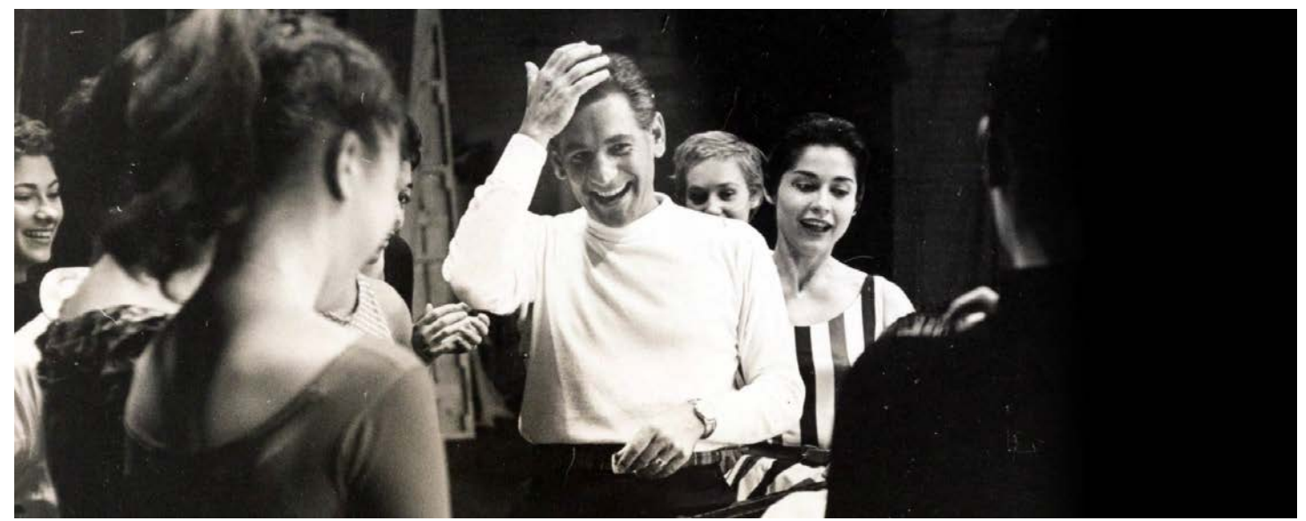
Leonard Bernstein with Carol Lawrence and the cast of West Side Story, 1957

far from the American vernacular characteristics that dominated Bernstein's Broadway scores. Advertised as a "comic operetta," Candide 's score in some ways was typical for its announced genre with some waltzes, but Bernstein added the schottische, gavotte, and other dances, and also entered the opera house with the aria "Glitter and Be Gay" and dramatic finale "Make Our Garden Grow." The aria's coloratura matches almost anything from the nineteenth-century repertory, and the finale opens with wide-ranging solos and a duet for Candide and Cunegonde, followed by a contrapuntal tour-de-force for principals and chorus. Its tone is invariably hopeful, in glaring contrast to the remainder of the show. It is one place where one must question what Bernstein intended in a musico-dramatic sense.