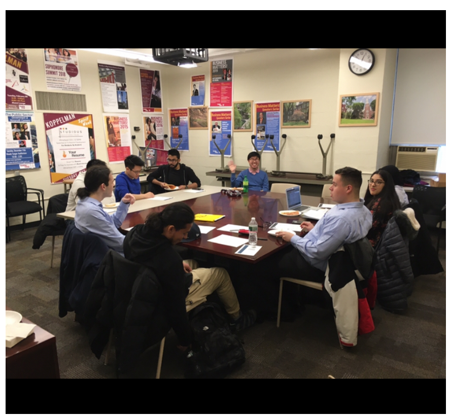
Preparing for a Toastmasters Meeting in the Student Club Room.