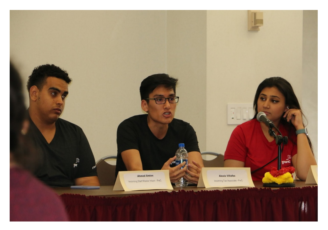
Koppelman students Interning at PWC share their experience at a Snack and Chat