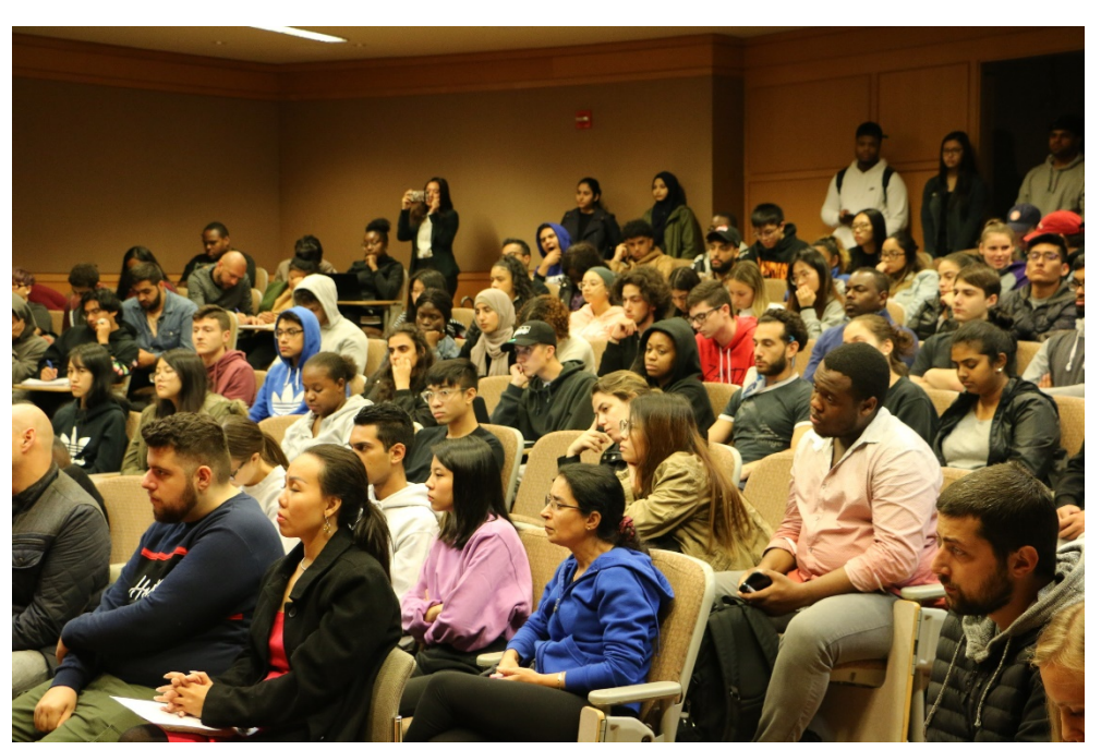
The student audience at the 2019 Business Matters! Event.