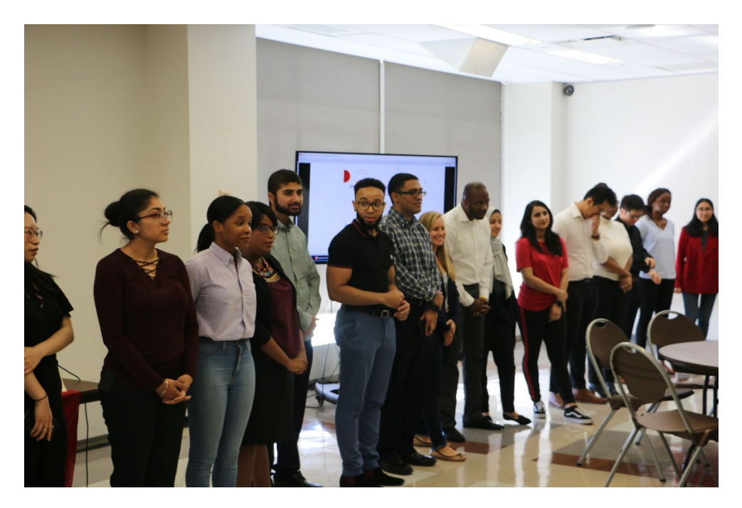
Student Attendees at Student/Faculty Speed-Dating Luncheon Fall 2019