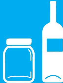
Glass Jars and Bottles