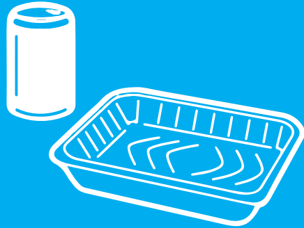
Metal Cans, Aluminum Foil