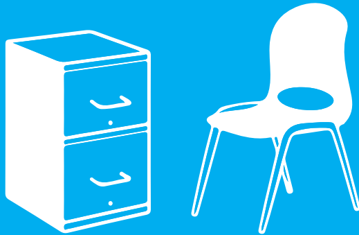
Mixed Metal, Plastic Objects